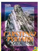
Seven Summits Carstensz Pyramid Reference: All Pages