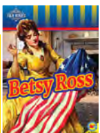
Folk Heroes Betsy Ross